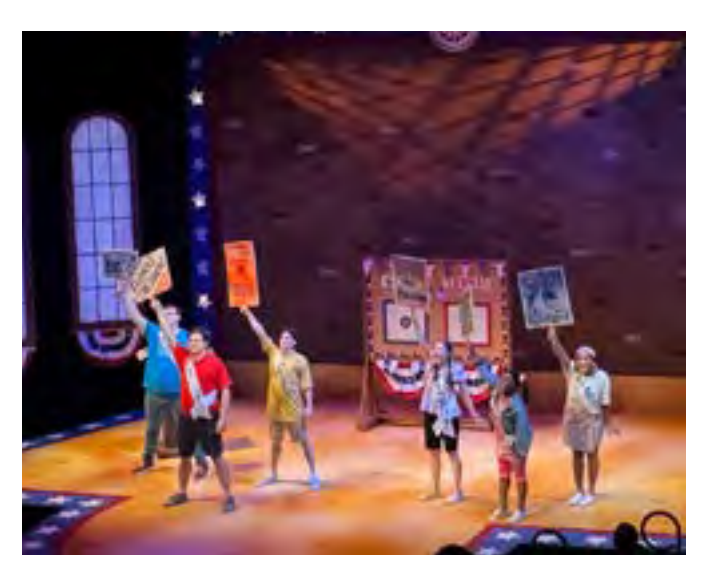
It's time for the election!