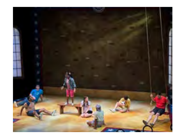
Grace tries one more time to make sure voices are heard for action.....