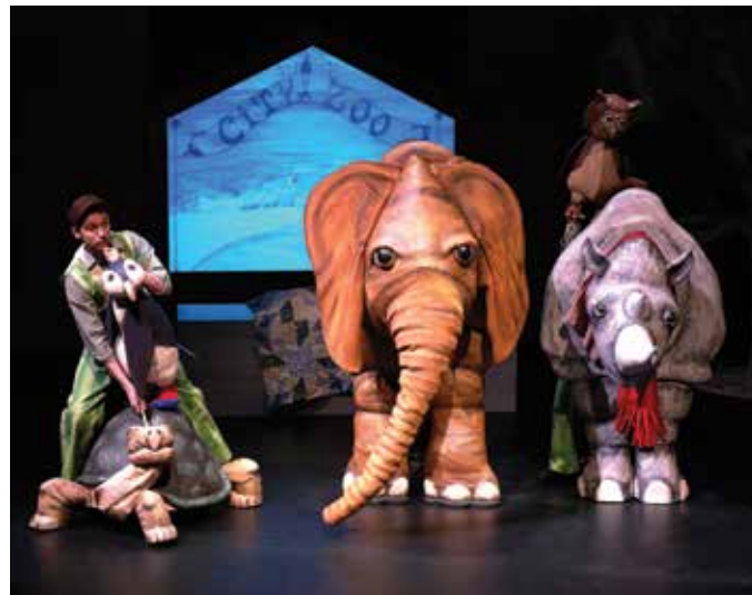
Puppets from A Sick Day for Amos McGee.