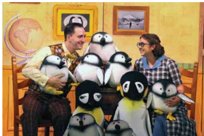
Puppets from Mr. Popper's Penguins.

visit his zoo friends, but fortunately, the animals know just how to help. The story fits nicely into the theater's theme, called "The Kindness Project," and the puppets were designed with a very specific goal in mind, to spread kindness.