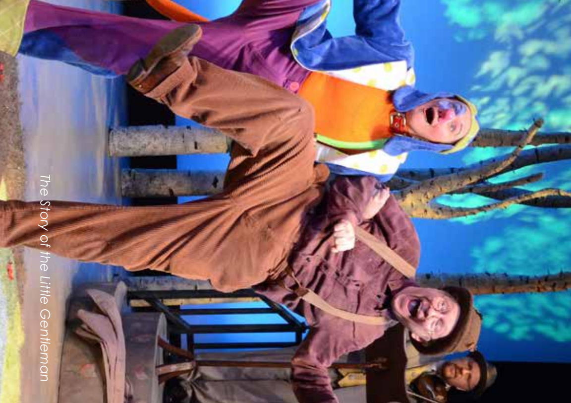
The Story of the Little Gentleman