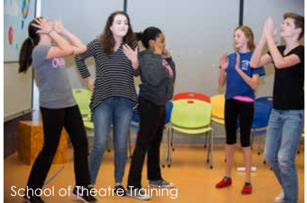
School of Theatre Training

Over 450 students enrolled in School of Theatre Training.