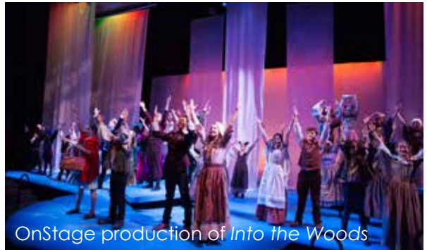
OnStage production of Into the Woods

OnStage provided professional level stage experience to nearly 160 students.